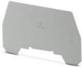
Separating plate, Length: 72 mm, Width: 0.8 mm, Color: gray

Please be informed that the data shown in this PDF Document is generated from our Online Catalog. Please find the complete data in the user's documentation. Our General Terms of Use for Downloads are valid ( http://phoenixcontact.com/download )