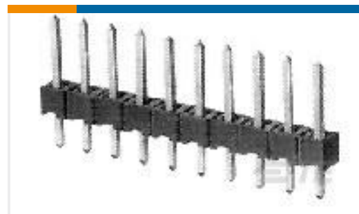
TE Part #3-825433-2 MOD 2 PINHDR 1X32P.