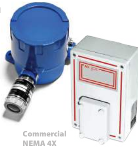
Commercial NEMA 4X