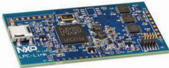
LPC-Link JTAG/SWD debugger

The LPC-Link JTAG debugger brings exceptional value to the LPCXpresso tool since it can also be used with other LPC evaluation boards. That means engineers can use the same tools with other boards, including custom boards used in final production. LPC-Link provides the high-speed USB interface to the LPCXpresso IDE and is currently supported by the LPC3154.