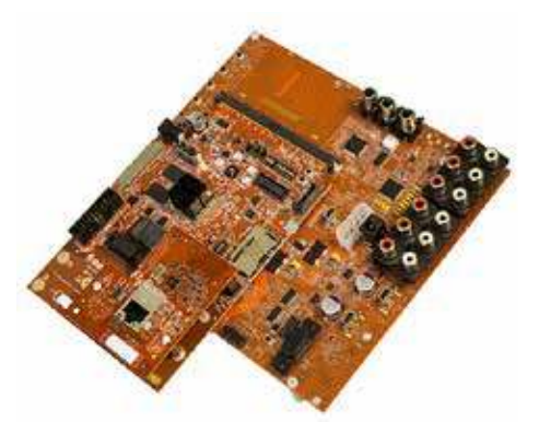
SABRE for Automotive Infotainment Based on i.MX 6 Series