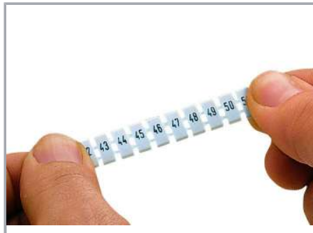
Stretching a WMB marker strip.

Subject to changes. Please also observe the further product documentation!