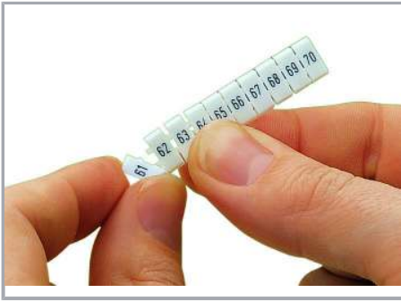
Separating an individual marker from the WMB marker strip – for larger terminal blocks.