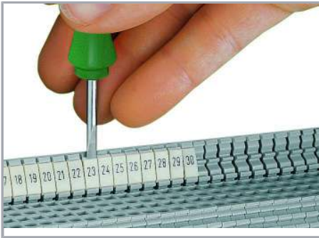
Snapping a WMB marker strip into the marker slot of the double marker carrier.