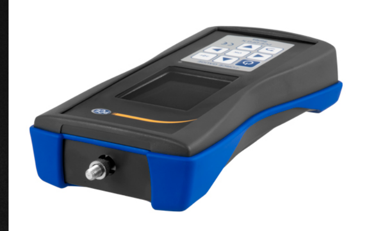
PCE-DFG N Digital force gauge

For tensile force measurement and pressure force measurement up to 20 N / Very high accuracy / Sampling rate 1600 Hz / 6 different measuring tips / USB interface / Software / Calibration certificate