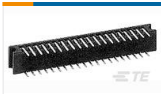
TE Part # 5-534204-3 36 MODU 2-PC CE RECP ASSY, RoHS