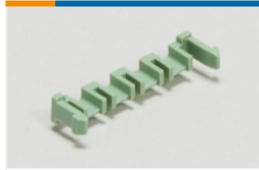
PCB Latches, Locks & Retainers(2)