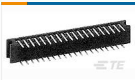
TE Part # 5-532956-6 36 MODII 2PC CE RCPT ASSY, RoHS