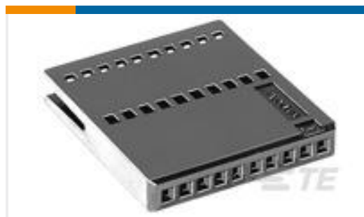
TE Part #487544-2 005 HOUSING FFC RCPT 050CL SR