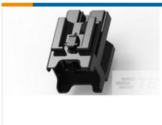
TE Part #1801619-1 RELAY 70A HOLDER