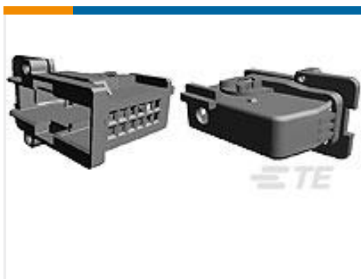
TE Part #1379095-2 COV+LEV MQS 12W 0DEG BLUE