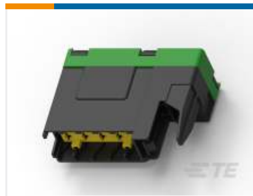
TE Part #1544647-1 BFH 5