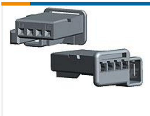
TE Part #1379029-6 4POS MQS REC