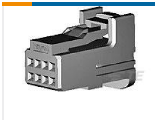
TE Part #1379662-5 12W PLUG HSG ASSY NATURAL