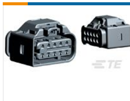
TE Part #1801600-2 RECEPTACLE HOUSING, MCON, 10 W, SEALED