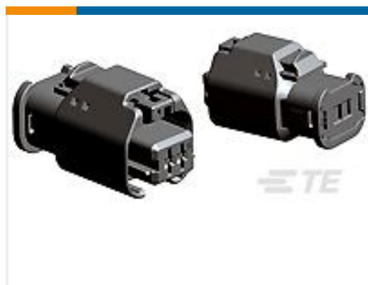
TE Part #1801175-1 2W RECEPTACLE HP CONNECTOR BLACK