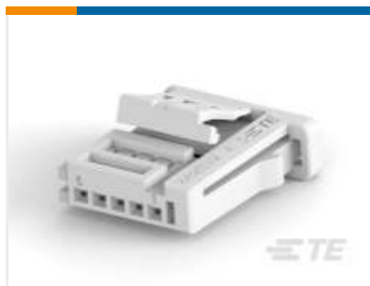
TE Part #2282154-2 6POS,NANOMQS,REC HSG,CODB