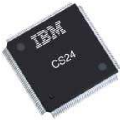
Figure 1: IBM's single-chip digital audio/video decoders integrate advanced features for high-performance solutions.