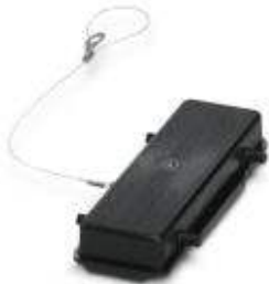
HEAVYCON protective cover, B24, for HC-EVO-B24... supporting base element, for double locking latch, with retaining cord with combination eyelet, IP54

Please be informed that the data shown in this PDF Document is generated from our Online Catalog. Please find the complete data in the user's documentation. Our General Terms of Use for Downloads are valid ( http://phoenixcontact.com/download )