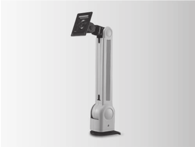
Table Arm For All PPC Models