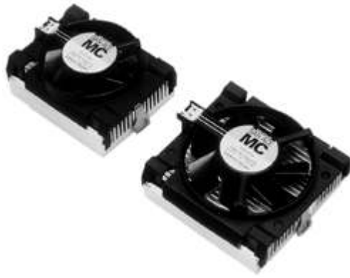
Fig.3 Thin "SAN ACE MC" series for Pentium® III