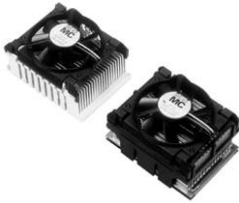
Fig.2 "SAN ACE MC" series for Pentium®4