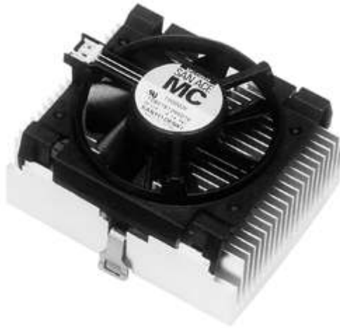
Fig.1 "SAN ACE MC" for Pentium® III