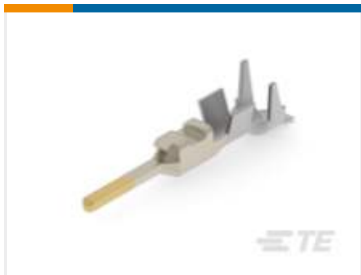
TE Part # 1-2834068-3 PIN CONTACT,MINIATURE WATERPROOF CONN