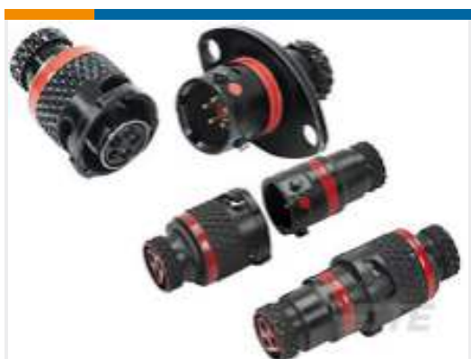
TE Part #ASU103-05SN-HE INLINE RECEPT ASSY ASU 5 WAY