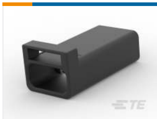
TE Part #2-2834075-2 2P REC, MINIATURE WATERPROOF CONN.BLACK