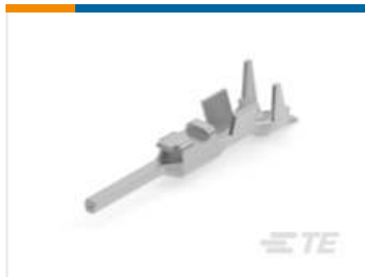
TE Part # 1-2834068-2 PIN CONTACT,MINIATURE WATERPROOF CONN