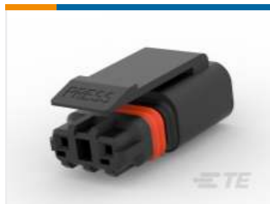
TE Part #2-2834074-2 SlimSeal Miniature Plugs