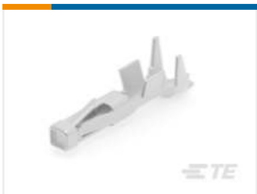
TE Part #1-2834067-2 SOCKET CONTACT,MINIATURE WATERPROOF CONN