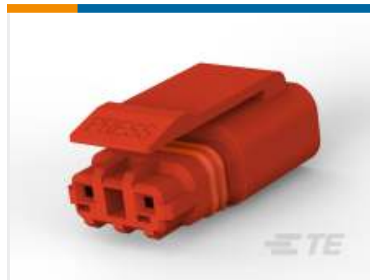
TE Part # 3-2834074-2 2P PLUG, MINIATURE WATERPROOF CONN,RED