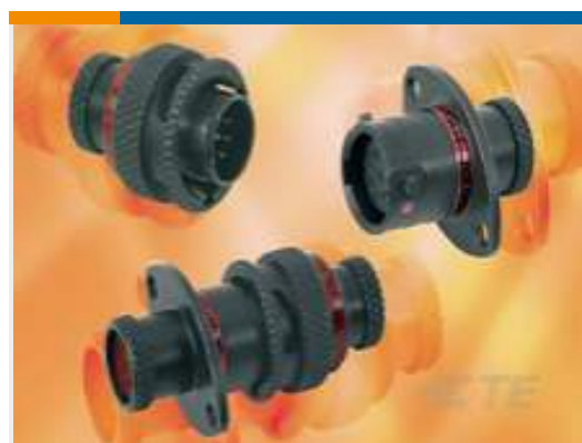
TE Part #ASDD606-09PN-HE PLUG ASSEMBLY ASL 9-WAY