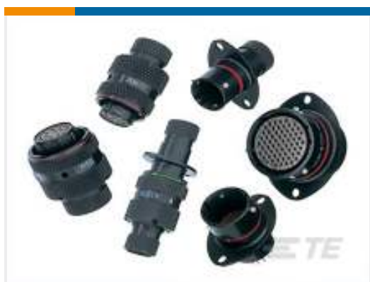
TE Part #AS607-35PB PLUG. BOOT TERMIN. TYPE 6 AS MICRO 7