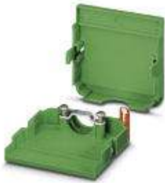
Cable housing, Pitch: 3.81 mm, Number of positions: 9, Dimension a: 36.68 mm, Color: green

Please be informed that the data shown in this PDF Document is generated from our Online Catalog. Please find the complete data in the user's documentation. Our General Terms of Use for Downloads are valid ( http://download.phoenixcontact.com )