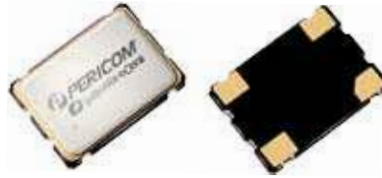
7.0 x 5.0mm Ceramic SMD