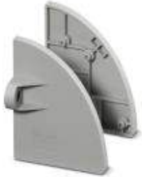
Flange cover, Color: gray

Please be informed that the data shown in this PDF Document is generated from our Online Catalog. Please find the complete data in the user's documentation. Our General Terms of Use for Downloads are valid ( http://download.phoenixcontact.com )