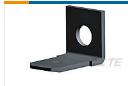
TE Part #42117-2 250 FASTON TAB TPBR