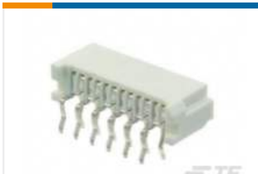
TE Part #2-84533-0 1.25mm FPC Connectors