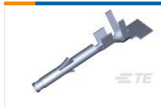
TE Part #171639-1 MINI U-M-N-L SOCKET L.P