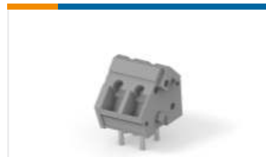
TE Part #2834078-1 5.0MM TOP ENTRY MSC 2P_GY