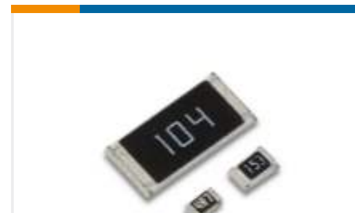
TE Part #5-2176349-2 CRGCO 2512 180K 1%