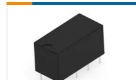
TE Part #8-1393792-5 V23105A5001A201