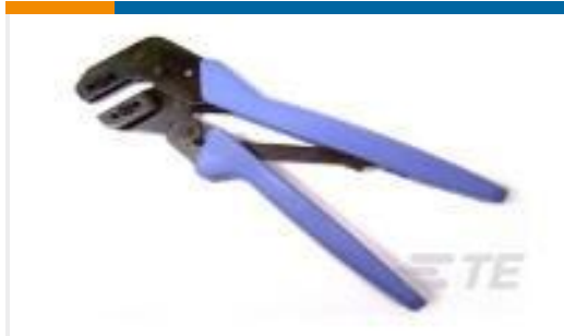
TE Part #58707-1 PROCrimp MINI-U-MNL2 TL & DIE