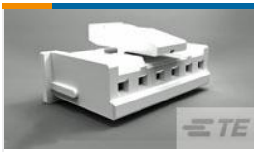
TE Part #1744417-9 9 POS EP 2.5 HSG, GLOW WIRE