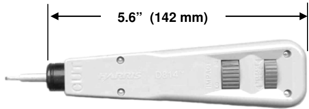
GPST (FRONT VIEW)

THIS COPY IS PROVIDED ON A RESTRICTED BASIS AND IS NOT TO BE USED IN ANY WAY DETRIMENTAL TO THE INTERESTS OF PANDUIT CORP.