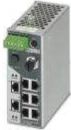
Smart Managed Narrow Switch (SMN) with eight 10/100 Mbps RJ45 ports, PROFINET mode (default)

Please be informed that the data shown in this PDF Document is generated from our Online Catalog. Please find the complete data in the user's documentation. Our General Terms of Use for Downloads are valid ( http://phoenixcontact.com/download )