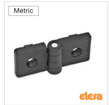
ELESA original design CFG.