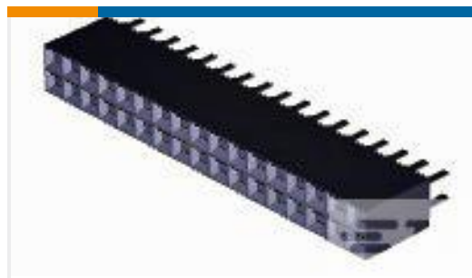
TE Part #1-534998-7 34 MODIV VRT DR CE 100/125