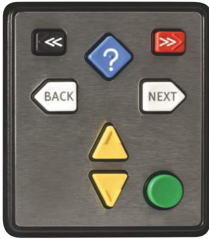
8 Key Layout