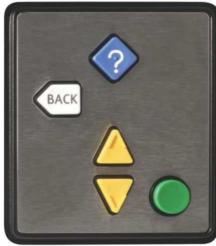
5 Key Layout

Storm Nav-Pad™ keypads are constructed to survive in exposed or hostile outdoor environments the keypads will withstand heavy use and abuse. They are sealed against the ingress of liquids and dust to survive regular wash down and sanitation procedures. Nav-Pad™ keypads feature an optional integral USB interface to ensure hassle free, single cable connection to the host system. (Please note: The USB cable is supplied 'hard-wired').