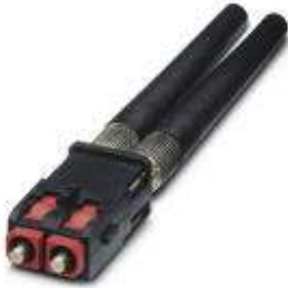
Fiber optic connector SCRJ, IP20, duplex, with fast connection technology, for PROFINET, for HCS fiber 200/230 µm, for individual wire diameter 2.2 mm

Please be informed that the data shown in this PDF Document is generated from our Online Catalog. Please find the complete data in the user's documentation. Our General Terms of Use for Downloads are valid ( http://download.phoenixcontact.com )