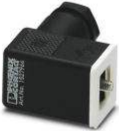
Valve connector, 3-pos., type CI, unconnected, screw connection, cable screw connection Pg7

Please be informed that the data shown in this PDF Document is generated from our Online Catalog. Please find the complete data in the user's documentation. Our General Terms of Use for Downloads are valid ( http://download.phoenixcontact.com )