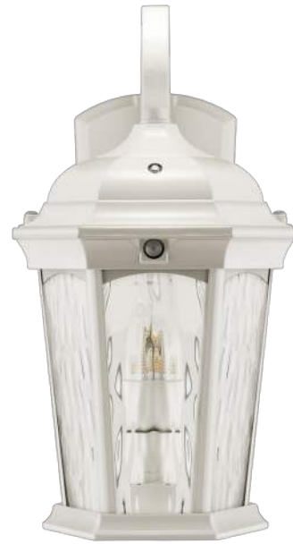
Integrated LED Fixture

*Note: Design, features and specifications subject to change without notice. Some features may not be available on all models. For more information please visit: www.eurilighting.com or call 1-888-743-5766