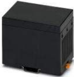
Electronic module, for PCB insertion, with a 12.5 mm tall covering hood

Please be informed that the data shown in this PDF Document is generated from our Online Catalog. Please find the complete data in the user's documentation. Our General Terms of Use for Downloads are valid ( http://phoenixcontact.com/download )