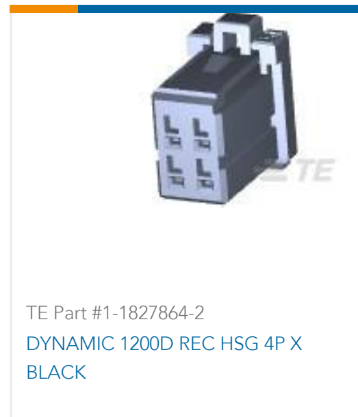
TE Part #1-1827864-2 DYNAMIC 1200D REC HSG 4P X BLACK