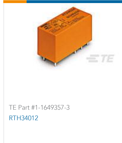
TE Part #1-1649357-3 RTH34012