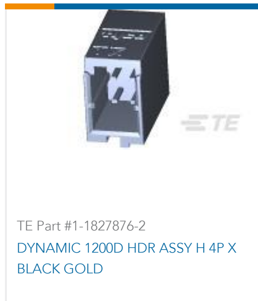
TE Part #1-1827876-2 DYNAMIC 1200D HDR ASSY H 4P X BLACK GOLD