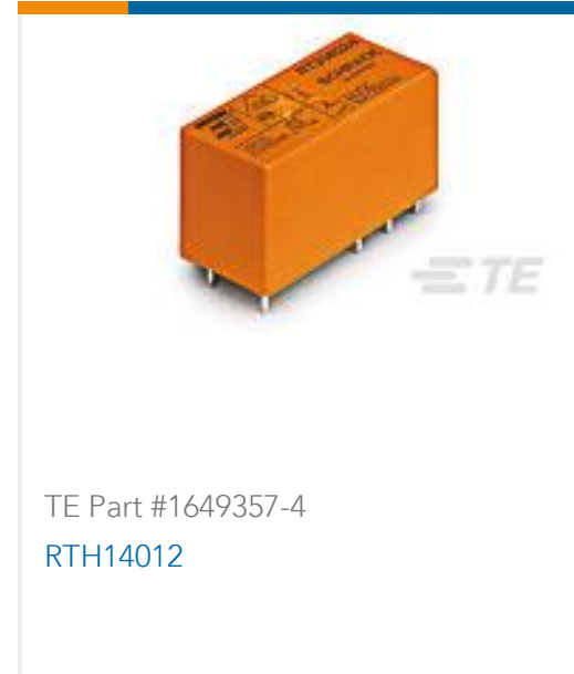
TE Part #1649357-4 RTH14012