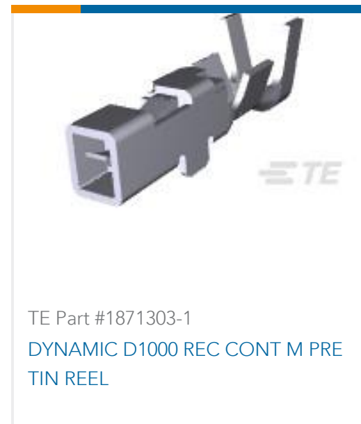
TE Part #1871303-1 DYNAMIC D1000 REC CONT M PRE TIN REEL