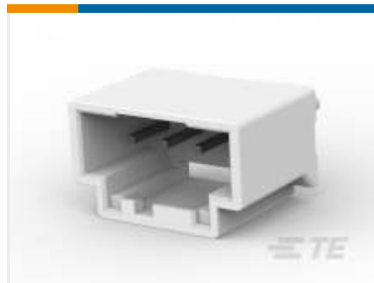
TE Part # 4-1971798-1 NEW GI CONN2.5 HDR ASMBLY 4P NC D1.0