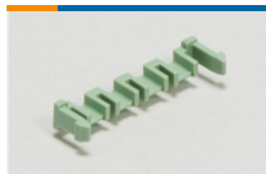
PCB Latches, Locks & Retainers(5)