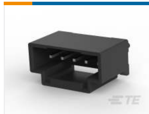
TE Part # 5-1971798-5 NEW GI CONN2.5 HDR ASMBLY 5P BLK D1.0