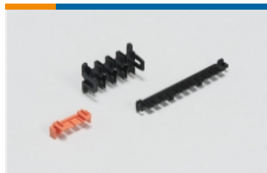
Rectangular Connector Locking(2)