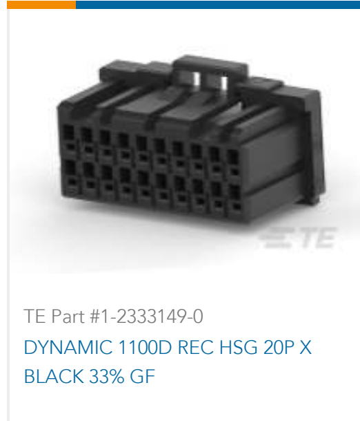
TE Part #1-2333149-0 DYNAMIC 1100D REC HSG 20P X BLACK 33% GF