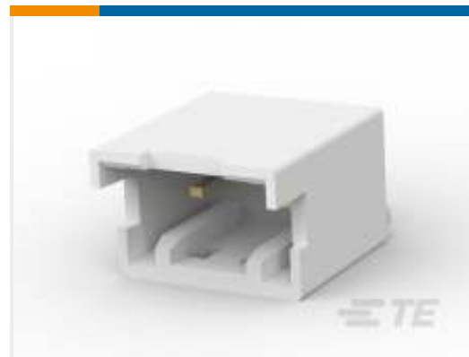
TE Part # CAT-G7534A-H342A Glow Wire Sig GRACE INERTIA Header