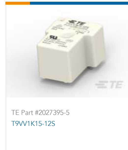
TE Part #2027395-5 T9VW1K15-12S