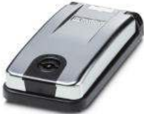
Mounting frame for one front plate/socket, frame: black, cover: metallic, closed with 3 mm two-way key bit.

Please be informed that the data shown in this PDF Document is generated from our Online Catalog. Please find the complete data in the user's documentation. Our General Terms of Use for Downloads are valid ( http://phoenixcontact.com/download )