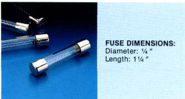
FUSE DIMENSIONS: Diameter: ¼" Length: 1¼"