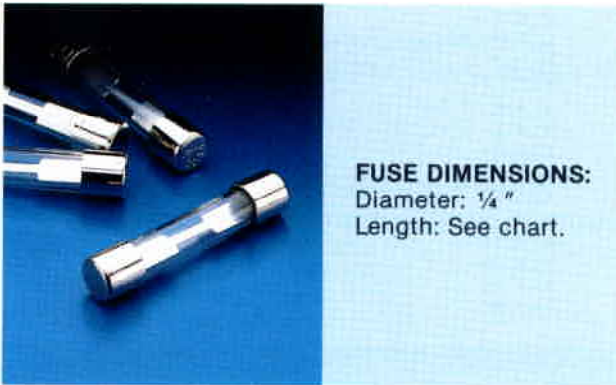
FUSE DIMENSIONS: Diameter: ¼" Length: See chart.