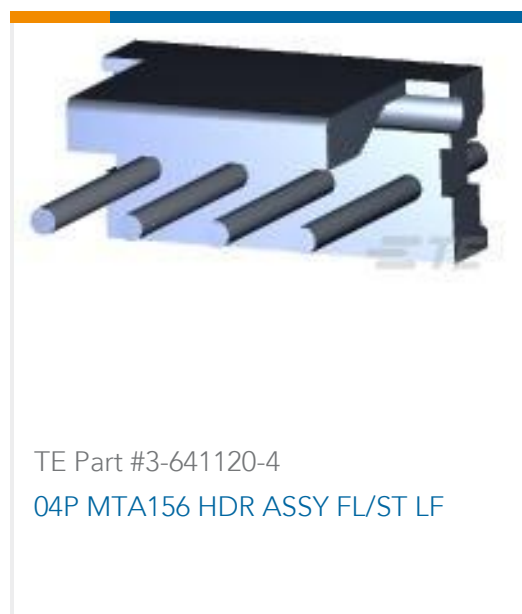
TE Part #3-641120-4 04P MTA156 HDR ASSY FL/ST LF