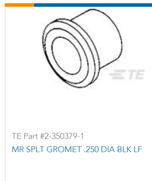
TE Part #2-350379-1 MR SPLT GROMET .250 DIA BLK LF