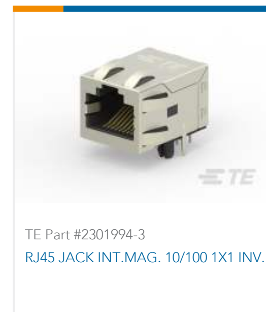
TE Part #2301994-3 RJ45 JACK INT.MAG. 10/100 1X1 INV.