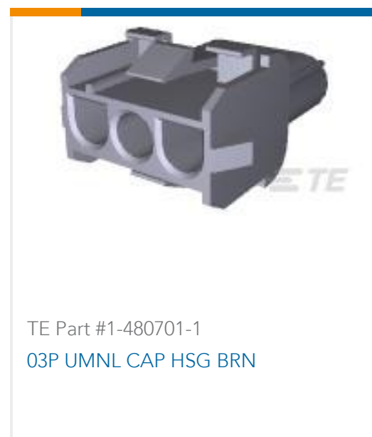
TE Part #1-480701-1 03P UMNL CAP HSG BRN