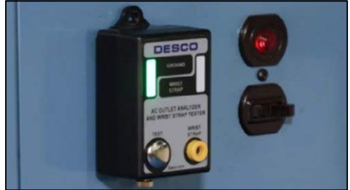
Figure 5. Verifying a properly wired AC outlet

The Ground LED will illuminate red and the audible alarm will sound if the outlet's wiring is incorrect or the path to equipment ground via the equipment grounding conductor is not intact.