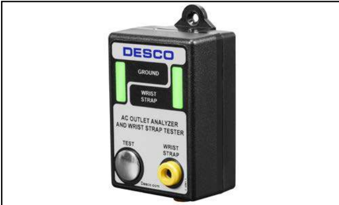
Figure 1. Desco 98133 AC Outlet Analyzer and Wrist Strap Tester