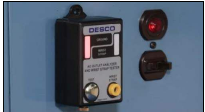
Figure 6. Verifying a properly wired AC outlet

The Ground LED will illuminate red and the audible alarm will sound if the outlet's wiring is incorrect or the path to equipment ground via the equipment grounding conductor is not intact.