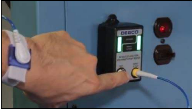
Figure 7. Performing a wrist strap test

If the test fails, check the wrist strap to ensure it is being worn correctly and/or needs to be replaced. Failures may also be caused by dry skin or minimal sweat layer. Apply an approved dissipative hand lotion such as Menda Reztore® ESD Hand Lotion to the wrist prior to use.