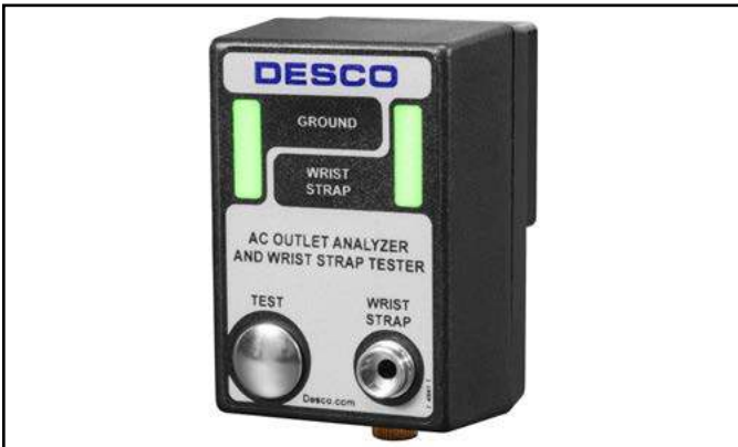
Figure 2. Desco 98134 AC Outlet Analyzer and Wrist Strap Tester

Use the AC Outlet Analyzer and Wrist Strap Tester to fulfill the S6.1 Section 6.3.1 requirement. “The hot, neutral, and equipment grounding conductor shall be verified to be in the proper wiring orientation in accordance with the National Electric Code (ANSI/NFPA-70).” (Grounding ANSI/ESD S6.1 section 6.3.1 Equipment Grounding Conductor)