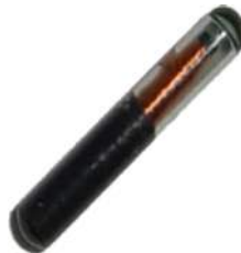
Figure 1-1. TRPGP40ATGC Transponder