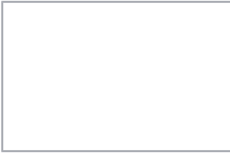
Testing with test probes.