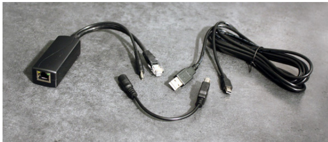
F200 PoE Kit Components