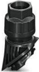
EVO plastic cable gland with bayonet locking; size M40, with filler plug

Please be informed that the data shown in this PDF Document is generated from our Online Catalog. Please find the complete data in the user's documentation. Our General Terms of Use for Downloads are valid ( http://phoenixcontact.com/download )