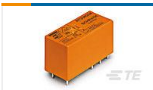
TE Part #8-1393238-3 RTD34005