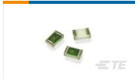
TE Part #9-2176089-5 RP 1J 0.166W 115K 0.1% 25PPM 1K RL