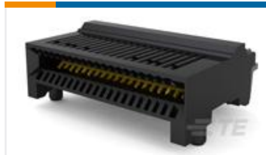
TE Part #1551920-2 zQSFP+ connector assembly