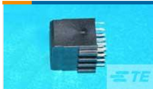
TE Part #1410270-2 MULTIGIG RT PWR .8" VRT RCP 4P PBFR