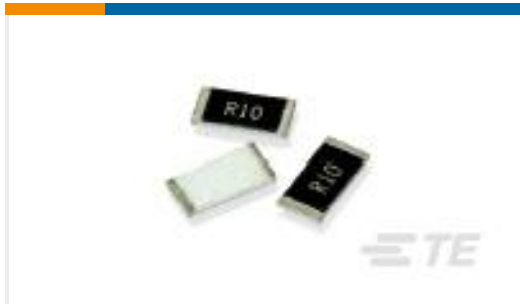
TE Part #2-2176055-9 RLP73K 2B R15 1% 1K RL