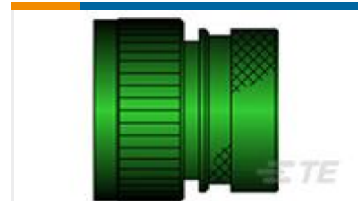
TE Part #808650-000 201M110-19C