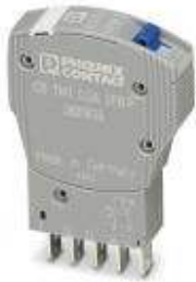
Thermomagnetic device circuit breaker, 1-pos., tripping characteristic SFB, 1 PDT contact, plug for base element.

Please be informed that the data shown in this PDF Document is generated from our Online Catalog. Please find the complete data in the user's documentation. Our General Terms of Use for Downloads are valid ( http://download.phoenixcontact.com )