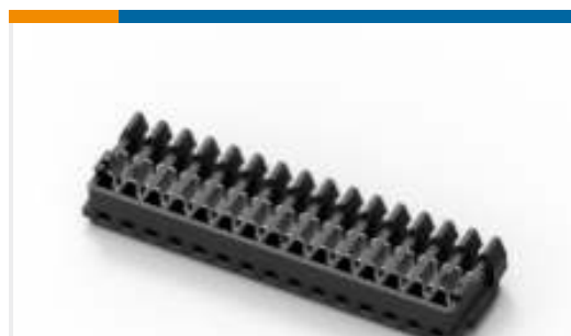
TE Part #3-353293-5 1.5MM CT MT REC ASSY 15P BLACK