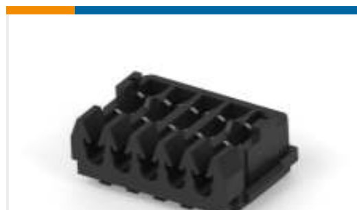
TE Part #2-353293-5 1.5MM CT MT REC ASSY 5P BLACK