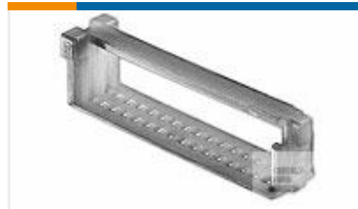
TE Part #2-353294-2 AMP MINI D/R HDR HSG 22P NATU