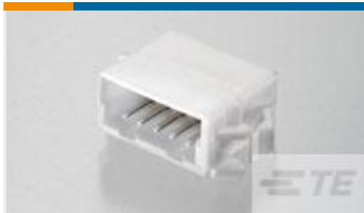
TE Part #292254-6 CT RELAY HDR ASSY 6P NAT