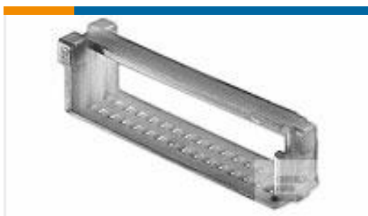
TE Part #2-353294-8 AMP MINI D/R HDR HSG 28P NATU