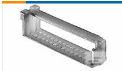
TE Part #3-353294-4 AMP MINI D/R HDR HSG 34P NATU