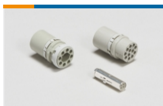
Circular Connector Contact Inserts(5)