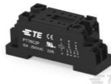
TE Part # 2071566-3 PT78C2P