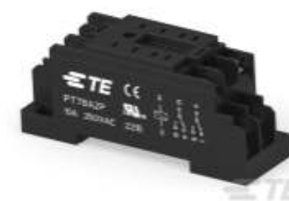
TE Part # 2071566-4 PT78A2P