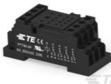
TE Part # 2071566-1 PT78C4P