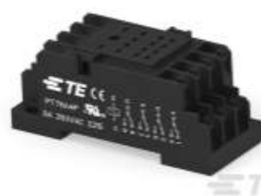
TE Part # 2071566-2 PT78A4P