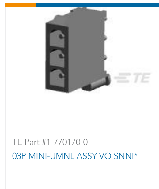
TE Part #1-770170-0 03P MINI-UMNL ASSY VO SNNI*