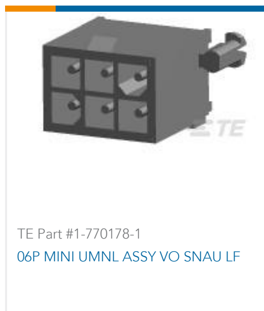
TE Part #1-770178-1 06P MINI UMNL ASSY VO SNAU LF