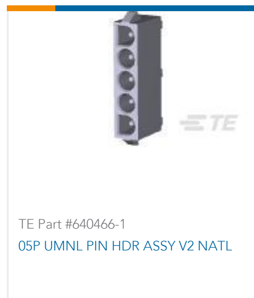
TE Part #640466-1 05P UMNL PIN HDR ASSY V2 NATL