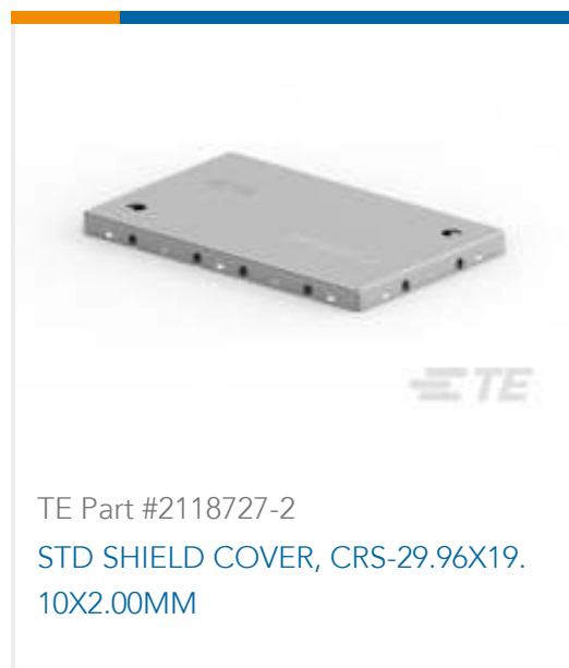
TE Part #2118727-2 STD SHIELD COVER, CRS-29.96X19. 10X2.00MM