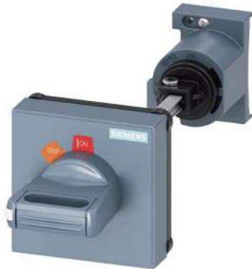
Door-coupling rotary operating mechanism For circuit breaker Size S00...S3, black 130 mm shaft