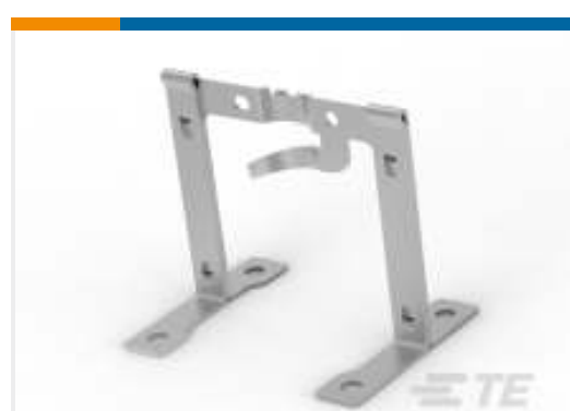
TE Part # 2295891-1 SCREEN CLAMP; MOTORMAN SHROUD