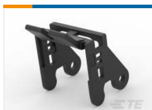
TE Part # 2295895-1 SIDE CLIP, PLASTIC