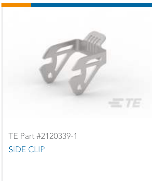
TE Part #2120339-1 SIDE CLIP