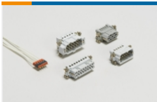
Rectangular Contact Inserts(5)