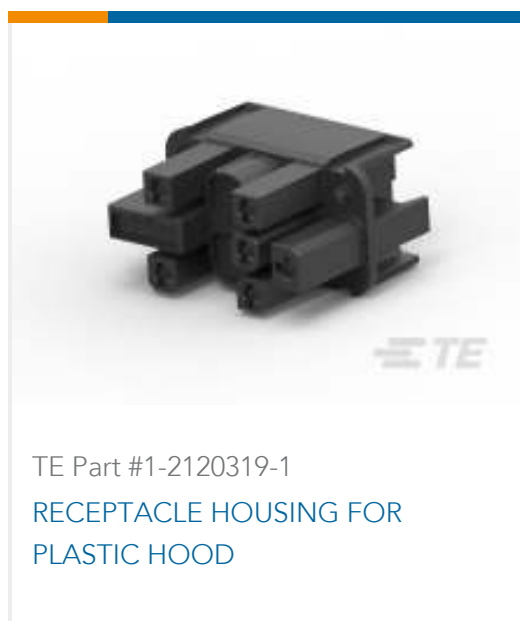
TE Part #1-2120319-1 RECEPTACLE HOUSING FOR PLASTIC HOOD