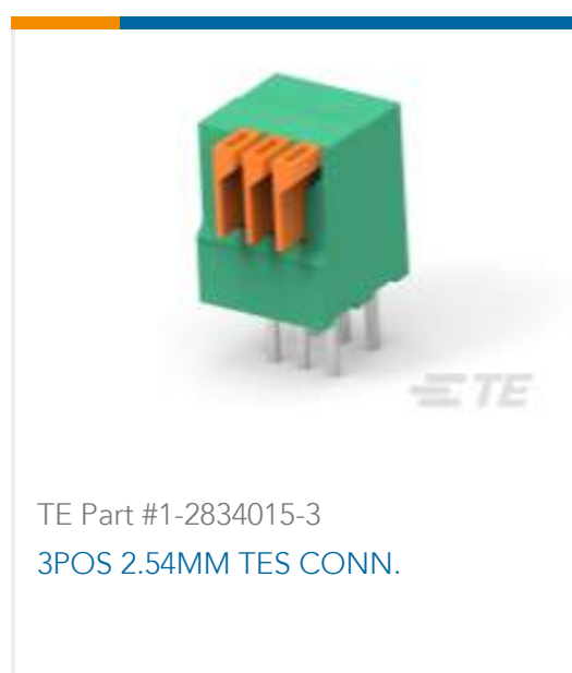
TE Part #1-2834015-3 3POS 2.54MM TES CONN.