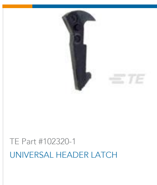
TE Part #102320-1 UNIVERSAL HEADER LATCH