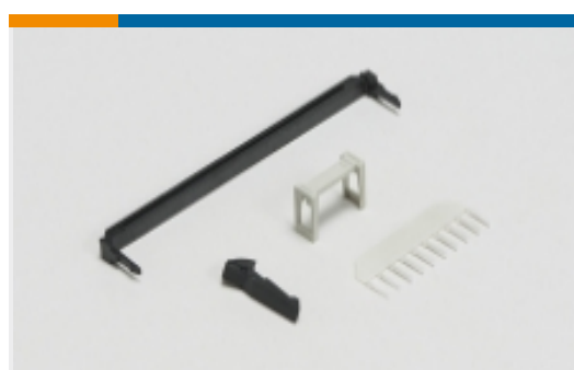
Ribbon Connector Accessories(13)