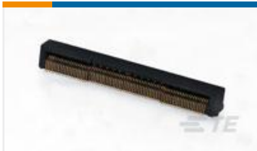
TE Part #2057630-1 CFP Receptacle Conn Assy