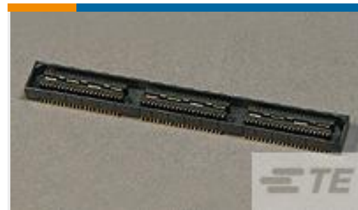
TE Part #7-1658012-3 MSB0.80RC-ASY84DP,-,10,VCTR