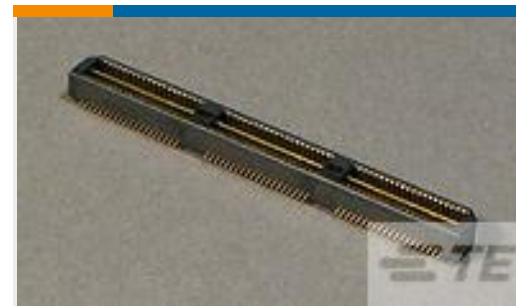
TE Part #7-1658013-3 MSB0.80PL5ASY84DP,GP,10,VCTR