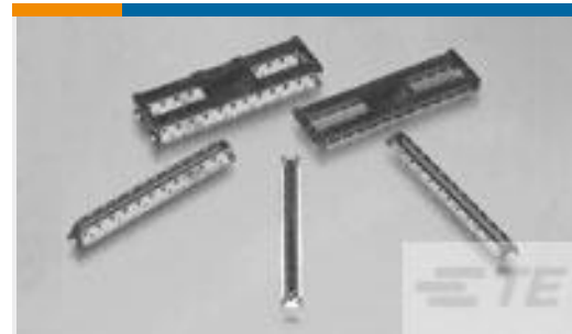
TE Part #6-5353606-6 .5FHR04H,220,S,GIG,08/Sn,HT,SEYes