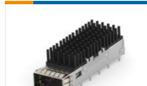
TE Part #1-2170704-0 CAGE ASSY, QSFP28 1X1, SPRING, HS