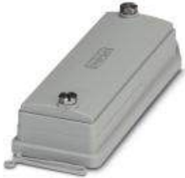
HEAVYCON ADVANCE, IP66, B16 protective cover, for panel mounting side, with screw locking, with retaining cord, diameter of retaining cord eyelet: 3 mm

Please be informed that the data shown in this PDF Document is generated from our Online Catalog. Please find the complete data in the user's documentation. Our General Terms of Use for Downloads are valid ( http://phoenixcontact.com/download )