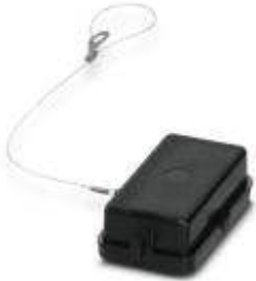
HEAVYCON protective cover, B10, for HC-EVO-B10... supporting base element, for single locking latch, with retaining cord with combination eyelet, IP54

Please be informed that the data shown in this PDF Document is generated from our Online Catalog. Please find the complete data in the user's documentation. Our General Terms of Use for Downloads are valid ( http://phoenixcontact.com/download )